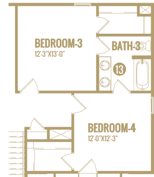
12 BATH-3 JACK-N-JILL

Watercolors, illustrations, and floor plans are for marketing purposes only and are subject to change at builder's discretion. Square footage is outside veneer and should be independently verified. This is not a legal document.